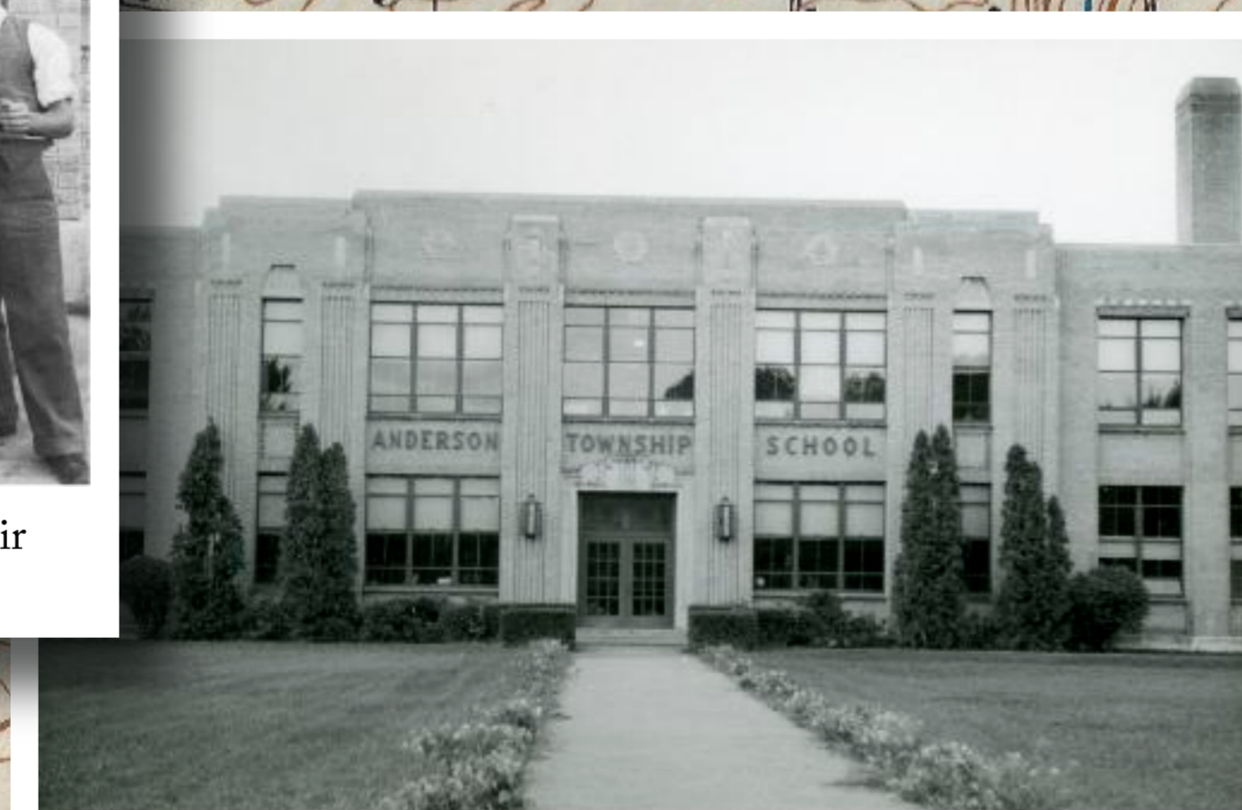
The central Anderson Township school building opened in the fall of 1929 with 525 pupils in first through eleventh grade. It was used for classes up to 1982.