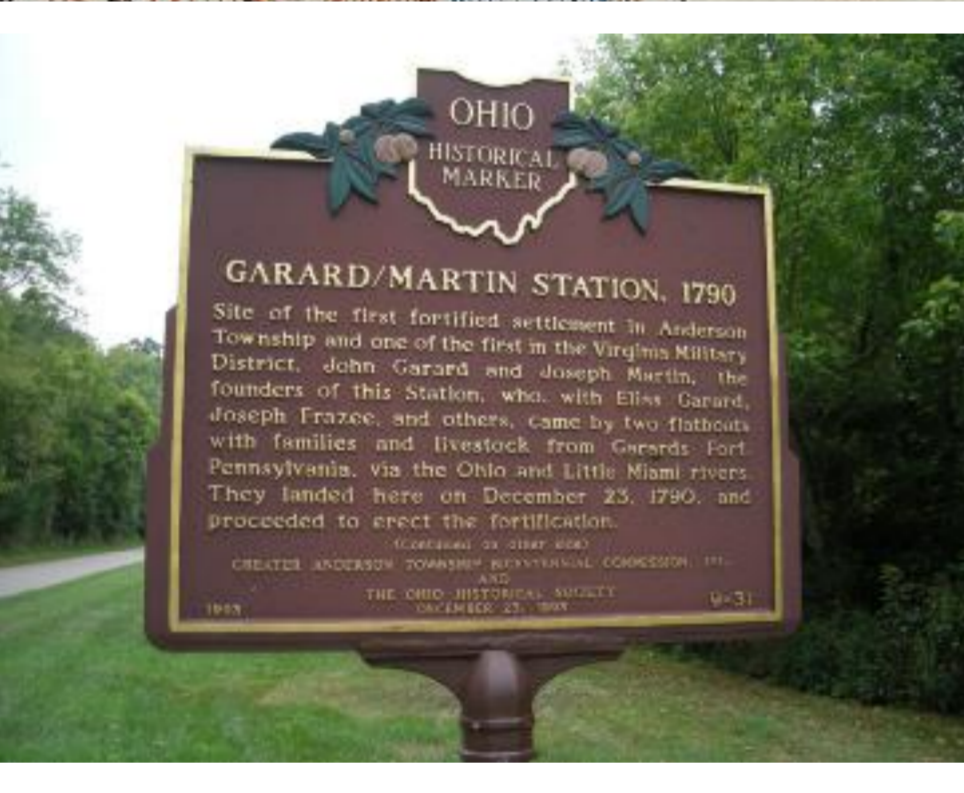
The Ohio Historical Marker recognizing the first fortified settlement in Anderson Township, Garard/Martin Station, 1790, is located on Elstun Road, off Beechmont Avenue.