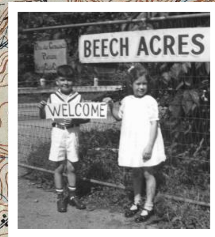
In 1950, the General Protestant Orphan Home moved to Beechmont Avenue on today's Beech Acres Parenting Center site. The annual Orphan Feast continued its tradition as one of the largest one-day festivals in Cincinnati up to the late 1980s.