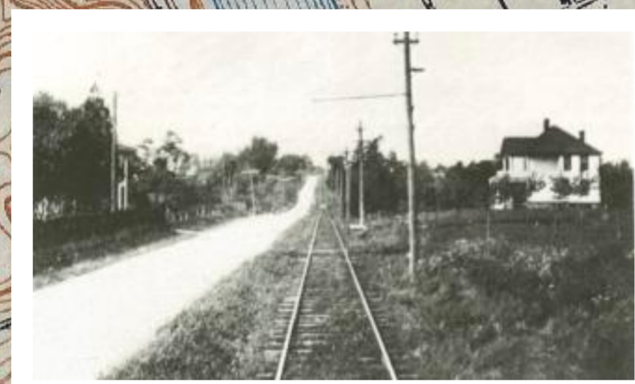
Beechmont Avenue in about 1910, looking west toward the intersection with Forest Road. It was a narrow and dusty road with the tracks of the Interurban Railway & Terminal Company alongside it.