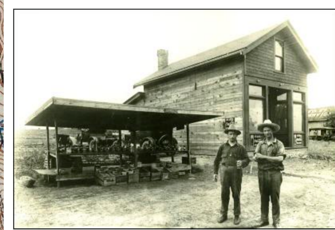
The Davis Market operated at the intersection of Beechmont Avenue and Salem Pike in the 1920s.