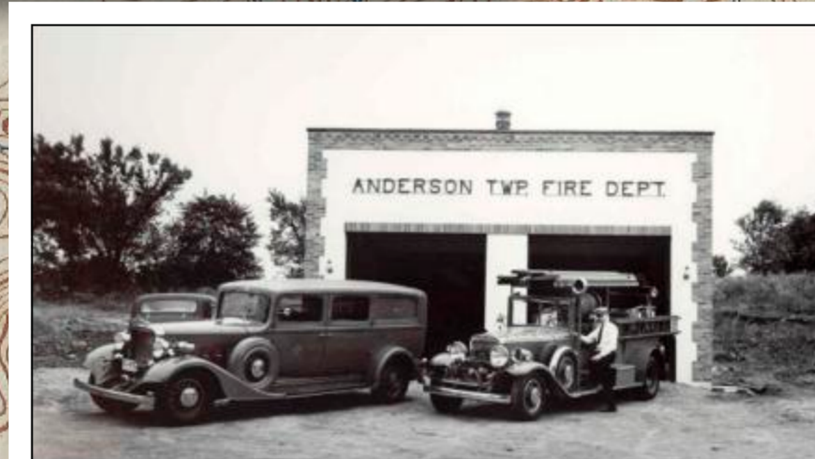
Anderson Township's first fire station was centrally located on Salem Pike near Beechmont Avenue in 1942.