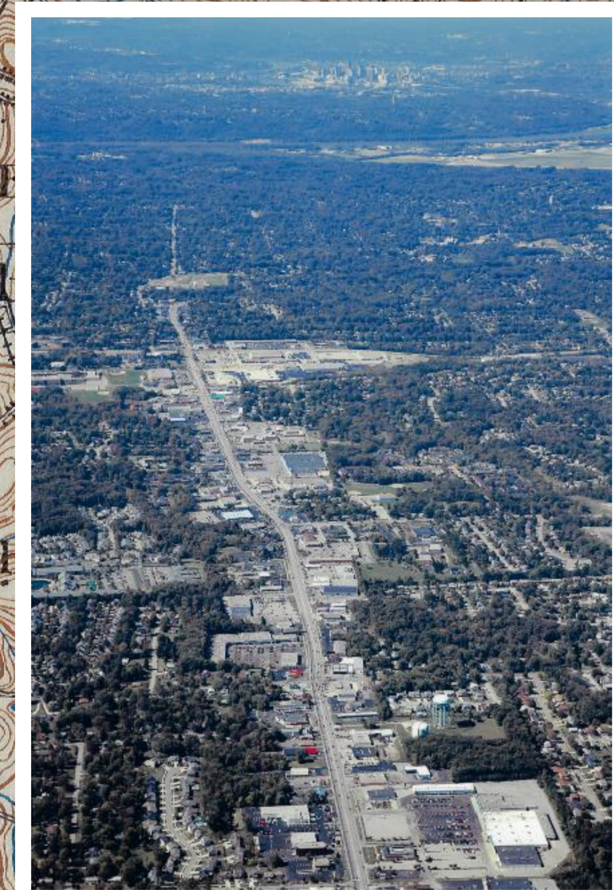
Aerial view of Beechmont Avenue looking west in 2004.