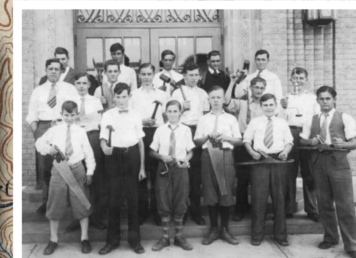
Industrial arts students at Anderson School display their tools for the yearbook photographer in about 1931.