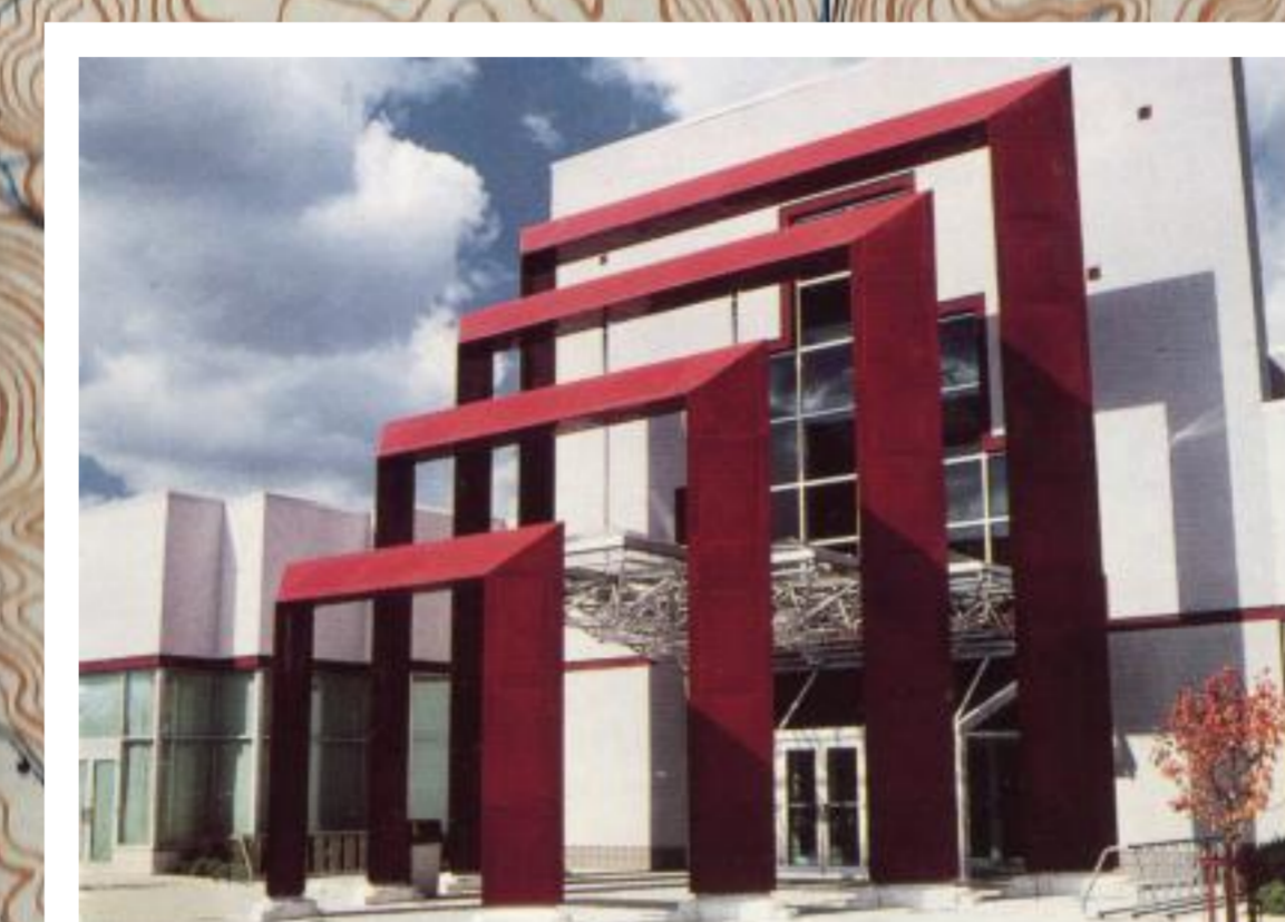
During its heyday, Beechmont Mall hosted some 50 stores, mostly attracting shoppers in the Anderson area.