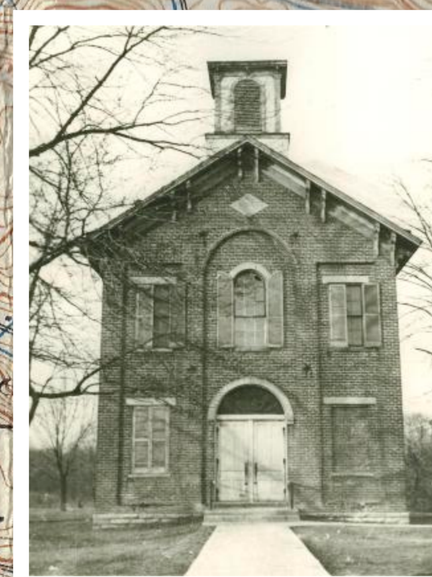
Located on Beechmont Avenue across from Salem Pike, the Fruit Hill District 13 School was built in the 1870s. After one central school was opened in 1929, the building was used commercially until being razed in the 1970s.